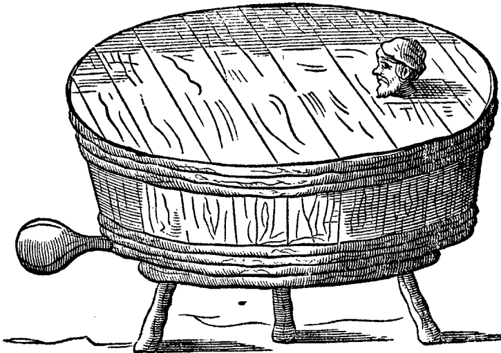
(See no. 1203).

OFFERED FOR SALE AT NET PRICES (POSTAGE EXTRA)